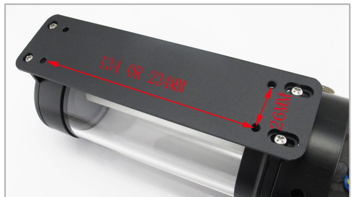
6. To mount the reservoir you will need to drill four holes onto a case panel. You can then attach the reservoir by using the four supplied M4 screws.