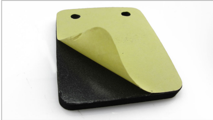
1. Remove the yellow film from the back of each pad.