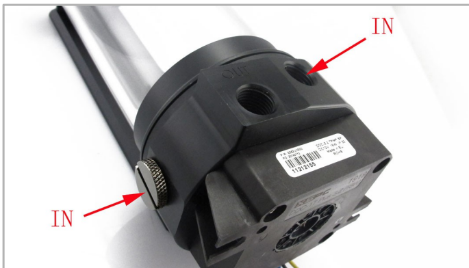
3. The pump had one outlet and two inlets. Attach the hose fittings to your ports of choice.