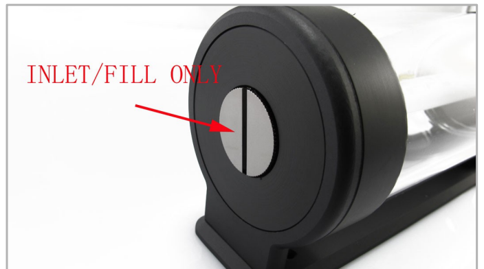
4. The fill cap can also be used as an inlet with the use of a M20 to G1/4" adapter. The fill cap cannot be used as an outlet.